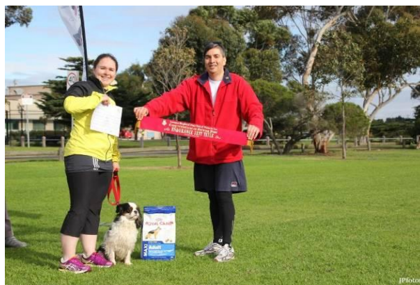
5. Presenting Darenti Midnight Dash CD RA ET!