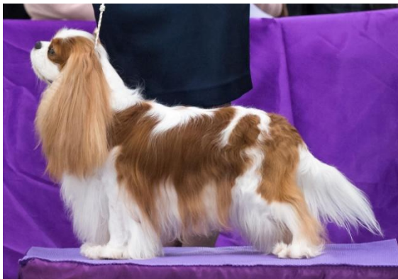
Best Open in Show Melloway Adrenalin Rush (Egan/Weekes)