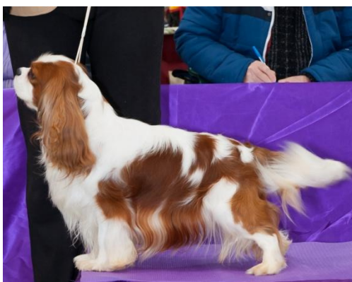
Best Intermediate Blacktree Kiss Me One Last Time (Kleinitz)