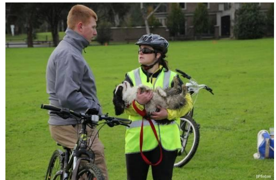
4. Liaising with my “Pit Manager”.