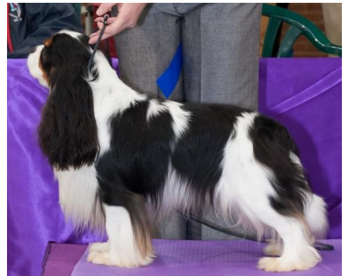
Best Australian Bred in Show Ch. Dapsen Destruction Man (Petersen)