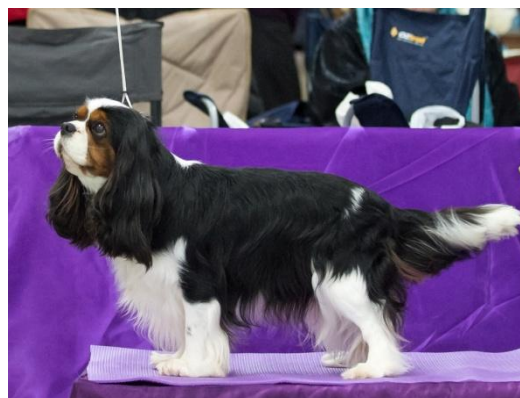
Best Veteran In Show Ch. Marcavan Ryderothastorm (Sylvester)