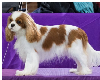
Best Intermediate in Show Dapsen Bejazzled (Petersen/Handled by K. Harding)