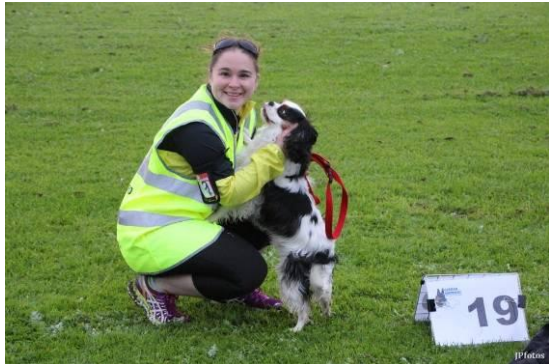
1. The Big Day – happy to be here

Completing an Endurance Test is a thoroughly satisfying experience, and one I highly recommend undertaking! All you need is a dog, and some determination! ☺