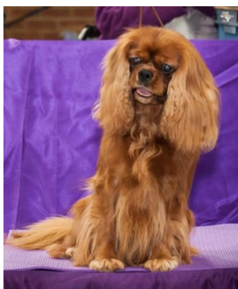
Best Neuter in Show Neut Ch. Clarelly Ruby Rose