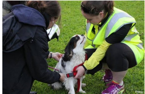
2. Pre-Test vet check.