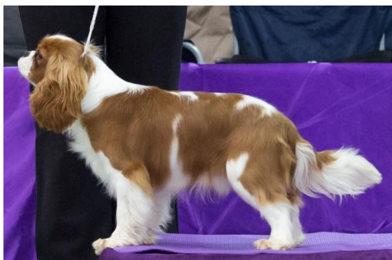
Best Puppy in Show Blacktree Forever A Rebel (Kleinitz)